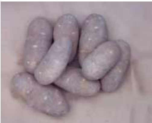
Figure 2. Photographs of A9014-2 showing: a) external tuber appearance and tuber flesh color, b) whole plant, c) light sprout, d) compound leaf and flower, e) tubers.